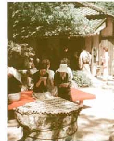
Hagi Grand Tea Ceremony